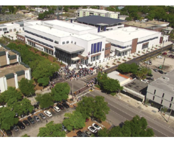
Largo HS photos: "Matt Shoats for Good, East Roswell Library photos: "Teri Byrd, St. Petersburg Police Dept.: "Aerial Innovation, FSU EOAS photos: "Southeast Drone Technologies

CITY OF ST. PETERSBURG Police Department HQ $61.8M, 163,300sf Currently under construction, the new police headquarters includes a new main building with an Administrative Wing and Property & Evidence Wing, as well as a parking structure and central energy plant.